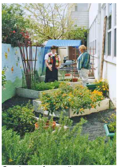
Good use of a small space

At other schools the amount of space for a garden may be abundant. These gardens must also be carefully planned. Consider garden development in several stages. Starting with a large garden may over-tax available time and funds. Click here to link to Garden Design Planting Beds for examples of bed sizes.