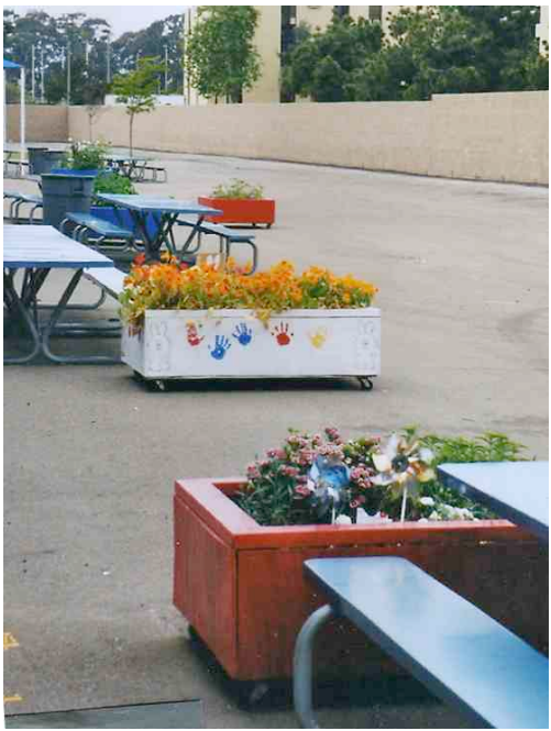
Use rolling raised beds

Once a garden site has been selected the appropriate size should be planned. Some schools have a limited amount of space for a garden and size has already been predetermined. In this situation, careful planning will insure that every square foot is allocated for the best possible planting advantage.